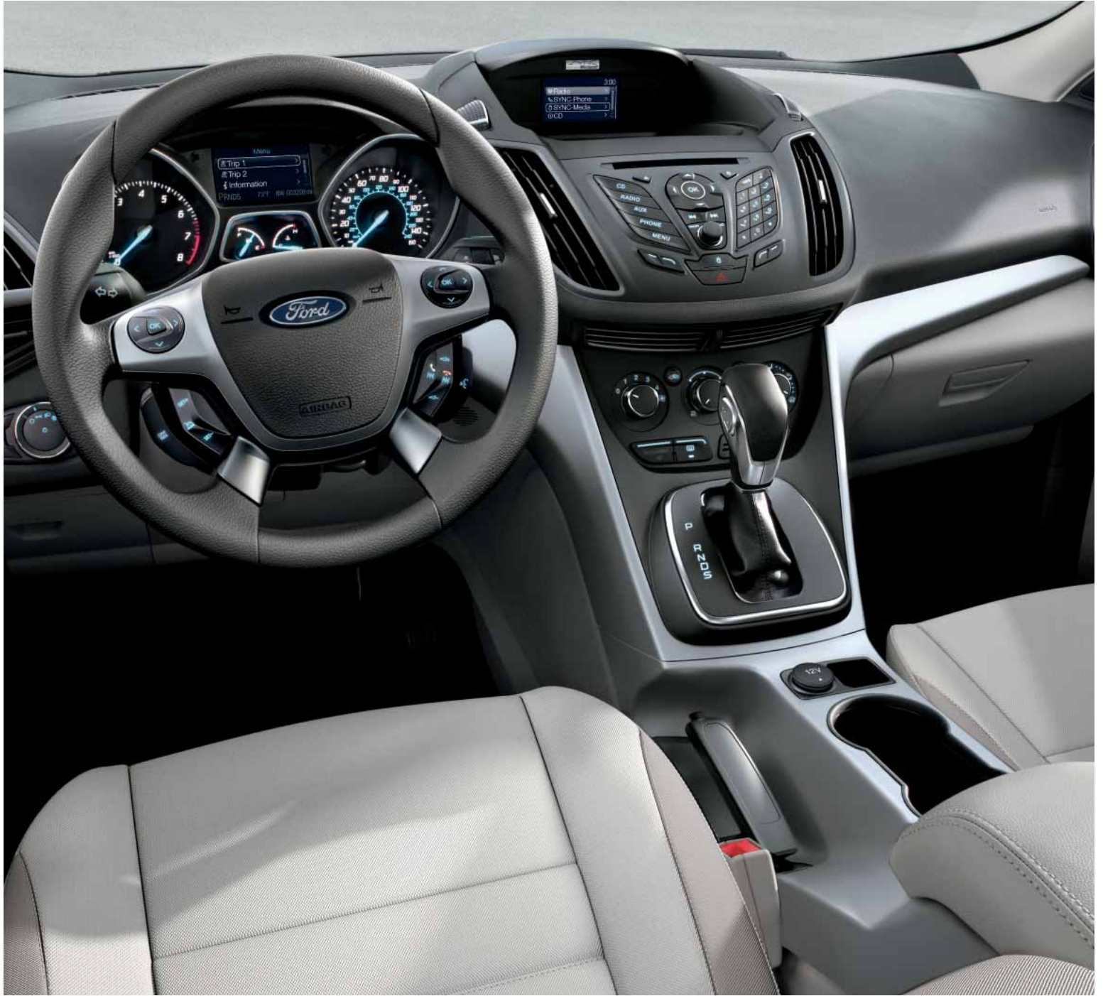
SE. Medium Light Stone cloth trim. | SE. 2nd-row 60/40 split seat with reclining seat backs. | Overhead console with sunglasses holder. | Ford SYNC ®