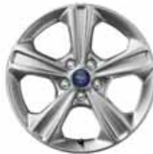
17" Sparkle Silver-Painted Aluminum Standard on SE