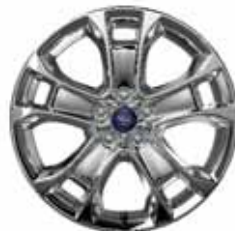
18" Polished Aluminum Available on SE